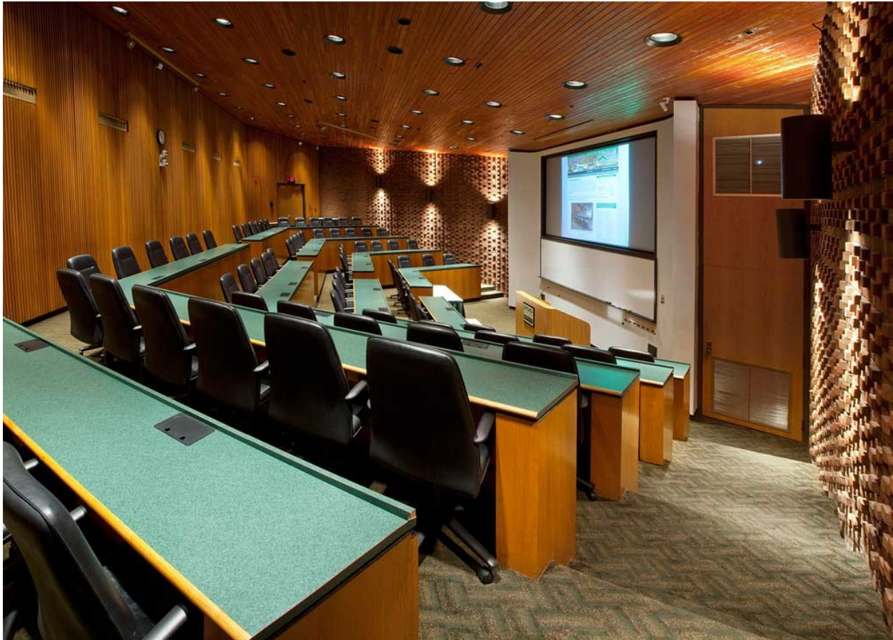
Amphitheater at the Management Education Center

As in previous years, we will be hosting the event at Michigan State University's Management Education Center (MEC) in Troy, MI: